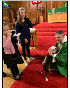
Blessing of the Animals on the Feast of St. Francis.