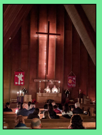
Silent Night sung by candlelight. Christmas blessings to all!