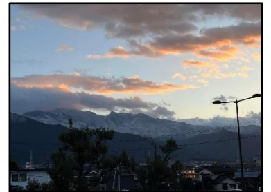
View from her apartment